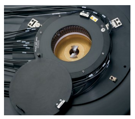
The Model 9139A Probe Card Adapter has been trusted by the industry for more than 10 years. Its combination of low current performance and high voltage capability makes it the ideal companion to the S530 Parametric Test Systems.